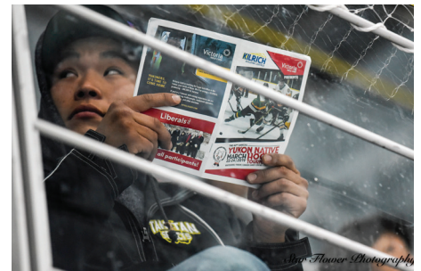
/ Spectator at the Yukon Native Hockey Tournament