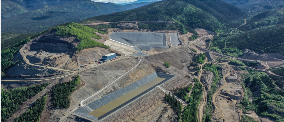
/ View of the lined Events Pond, Gold Recovery Plant and Heap Leach Facility