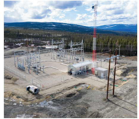
/ Power Plant connection to the Yukon Energy power grid now complete