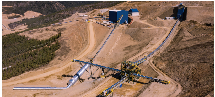
/ View of the conveyor system between the Primary Crusher (blue building on the right) and Secondary/Tertiary Crusher (blue building on the left).

As of early June we are now over >1,400,000 safe work hours without a lost time incident.