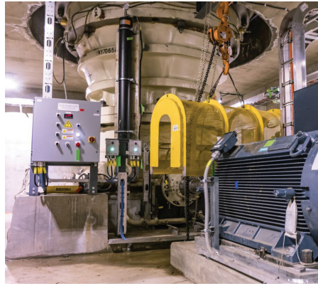
/ Installation of the Primary Crusher is complete