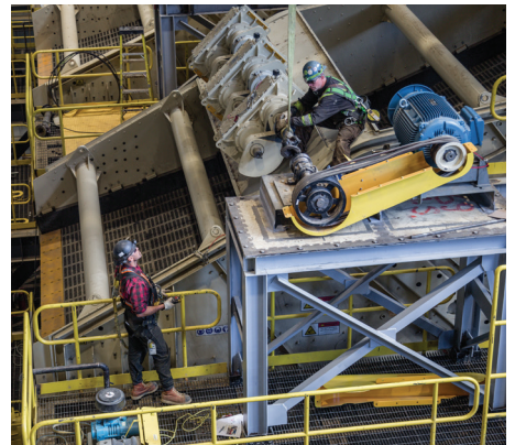
/ Finishing the installation of one of three Tertiary Crusher screens.