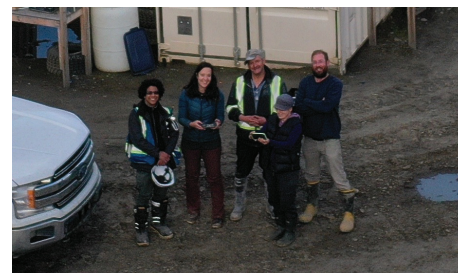
/ Victoria Gold geology team, Fall 2020