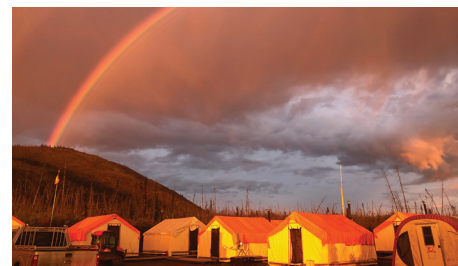
/ View of the Raven camp, Fall 2020

The 2021 exploration crew is being assembled to include Yukon local contractors and geologists, and we look forward to another productive and successful season.