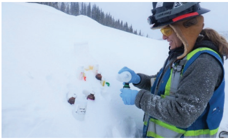
/ Winter surface water sampling at the Eagle Gold Mine

Sampling results are reported regularly to the Yukon Water Board and FNNND Lands Department, are publicly available at: www.yukonwaterboard.ca/WATERLINE/