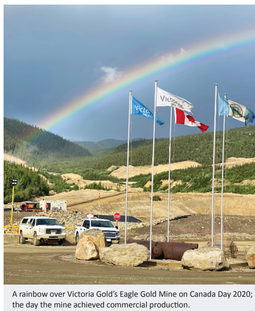
A rainbow over Victoria Gold's Eagle Gold Mine on Canada Day 2020; the day the mine achieved commercial production.