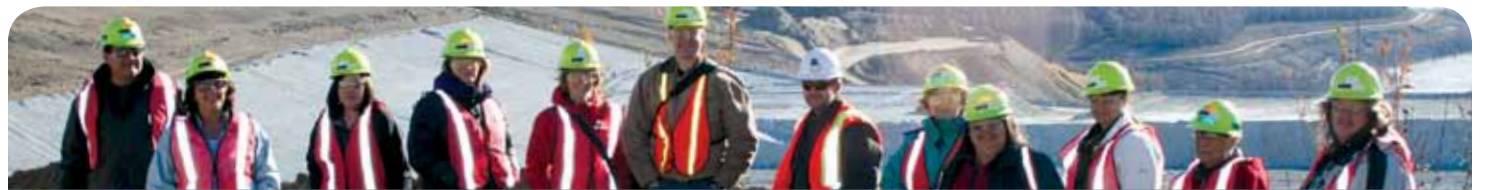
Representatives from the Yukon Environment Socio-Ec Assessment Board, the Mayo Renewable Resource Council, First Nation of Nacho Nyak Dun, the Village of Mayo and Victoria Gold visit the Ft. Knox Mine in Alaska.

The summer months are always busy with tours and this year was no exception.