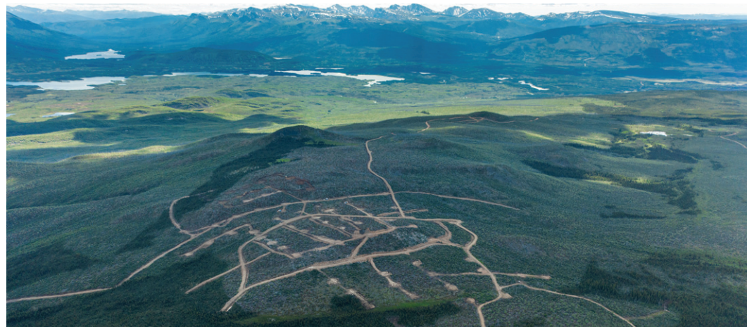
Aerial view of the exploration activities at the Raven target (looking northwest).