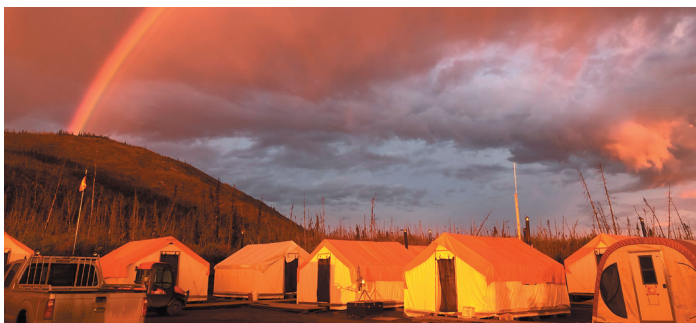
View of Raven Camp, Fall 2020

Raven was first identified in 2018 with late season surface trench discoveries. Follow-up drilling repeatedly returned high-grade gold intersections accompanied by prolific visible gold occurrences along a major and consistently mineralized corridor, which has grown from a single trench to 750 metres of defined mineralized with significant expansion potential.