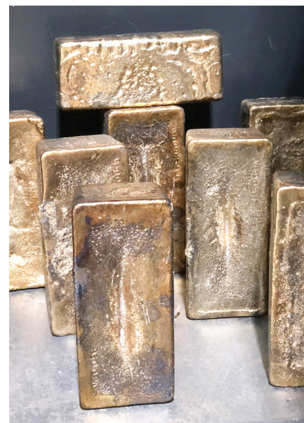
Recent batch of gold doré bars from the Eagle Gold Mine.