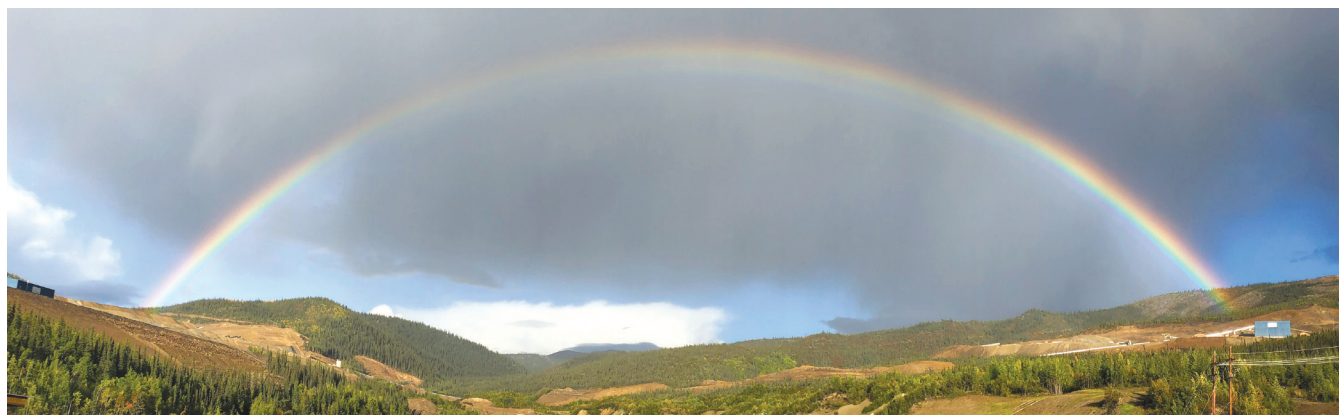
Gold at both ends of the rainbow above the Eagle Gold Mine.