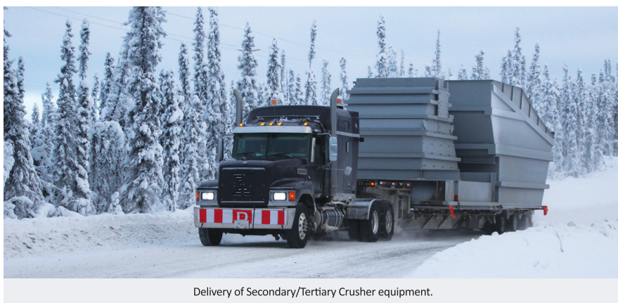
Delivery of Secondary/Tertiary Crusher equipment.